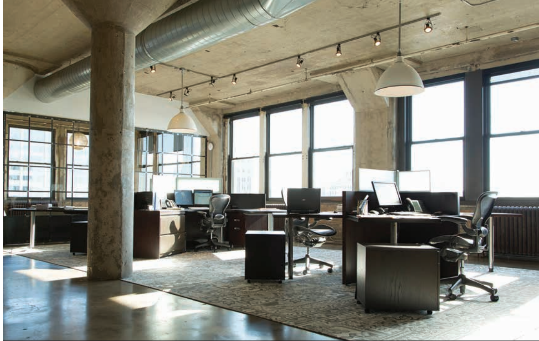
A glimpse at some of our finishes

There is no substitute for the natural aging of a building. We embrace and often emphasize the many wonderful and curious changes that happen over time. Faux is our biggest foe. Imperfections and distressed features complimented by clean lines and modern functionality is how we create our unique and memorable spaces. Wide open floor plates create endless possibilities.